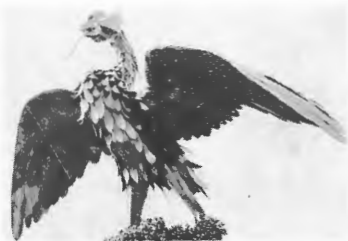
The lively Liver Bird.

The entry depicted a Liver Bird nesting on the globe of the earth, illustrating the theme of the parade, 'Liverpool and the World.'