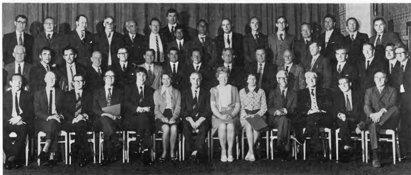
Some of the 20 and 25 year long service staff at North Wirral District.

FOR ALL MANWEB EMPLOYEES, PENSIONERS AND THEIR FAMILIES