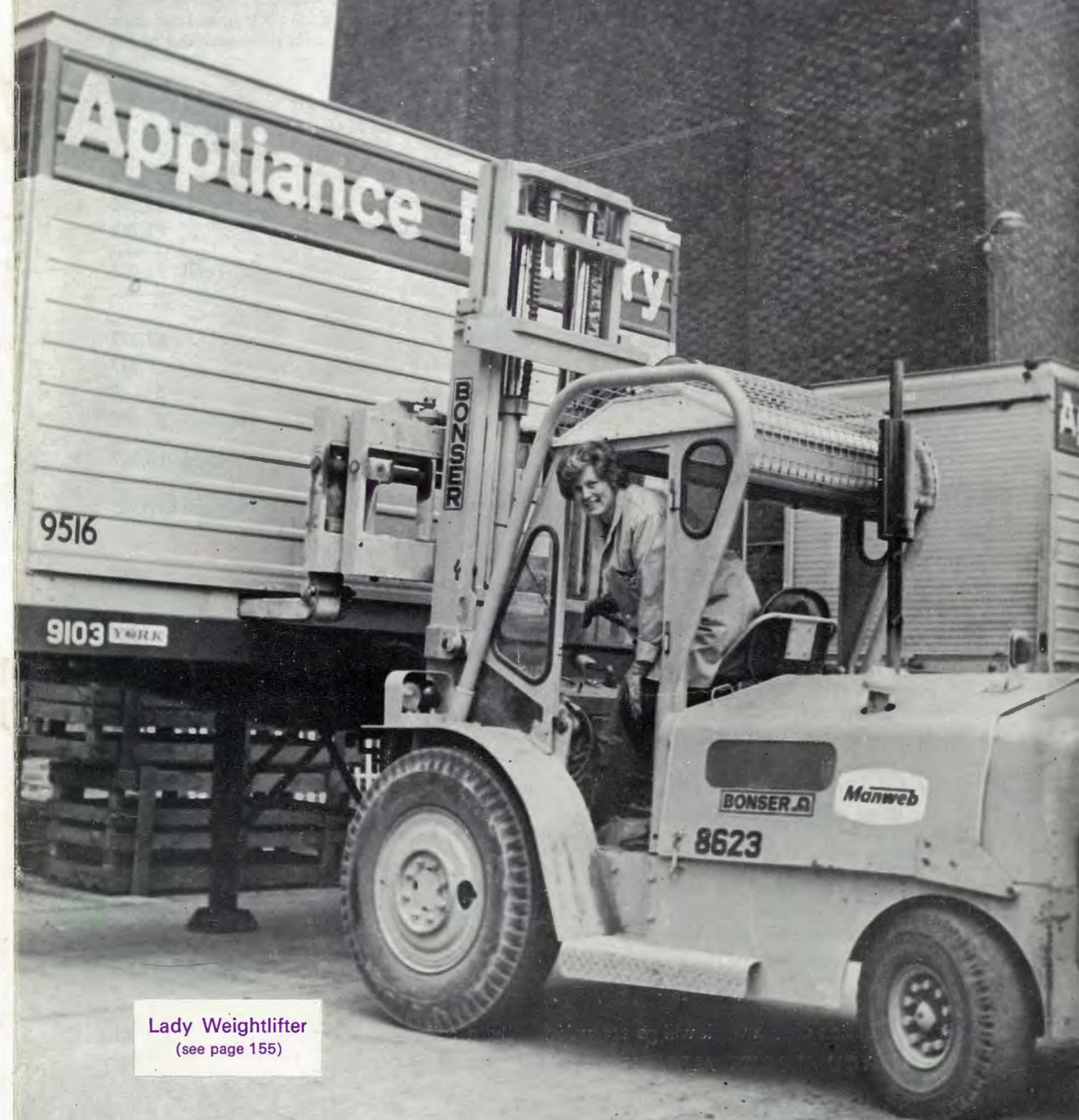
Lady Weightlifter (see page 155)

If you want your ad. repeated, a request to this effect should be made to The Editor.