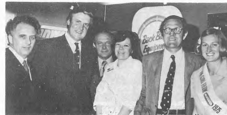
MANWEB and Greenall Whitley personalities at the exhibition at the Lord Daresbury Motel, Warrington.

The tenants in the latest phase of work—on the Windhurst Estate—were offered the choice of fuel by the Council. MANWEB co-operated in staging an exhibition demonstrating the various fuel applications—electricity, gas, and solid fuel. The case for electricity was explained to the tenants as they visited the exhibition, and this was followed up by door to door salesmanship